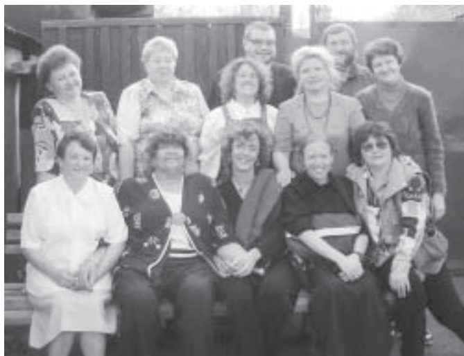
Russian and American nuclear safety activists meet with members of the NGO Step Towards in Argayash, Russia.

The program ended with a four-day conference in the city of Tomsk where the group met at a Soviet-style