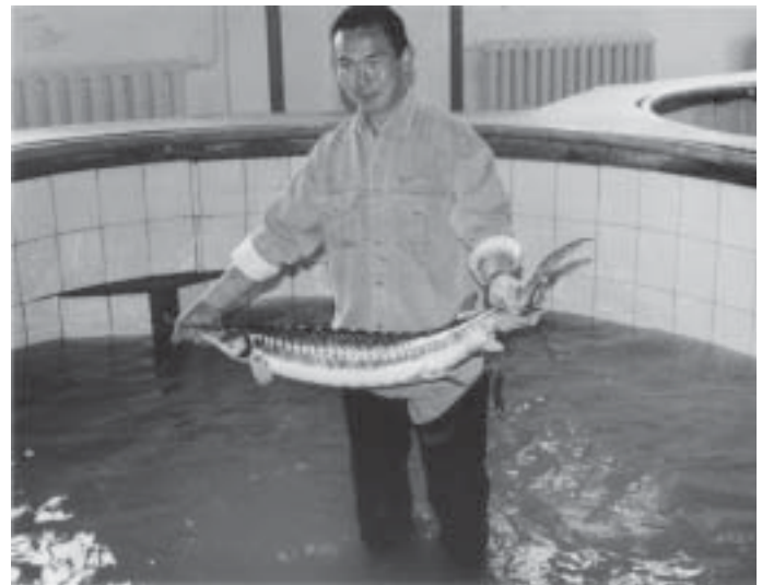
At a fish hatchery in Astrakhan, an employee proudly shows one of the sturgeon they are raising.